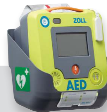
Universal Wall Mount with ZOLL AED 3 alone (without carry bag) Part# 8000-001255

The Universal Wall Mount holds the ZOLL AED 3 alone or in its carry case and is labeled with the green ILCOR AED symbol. It includes mounting hardware, consumable tracking card, wall-mount template, and installation instructions.