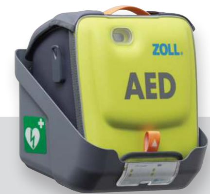
Universal Wall Mount with ZOLL AED 3, carry case, and backup CPR Uni-padz (in carry case) Part# 8000-001266