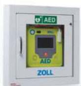
Semirecessed Wall Cabinet Part# 8000-001257

easy installation or the semirecessed or fully recessed models for less intrusive storage. All three models include an ILCOR (International Liaison Committee on Resuscitation) AED label set and installation instructions.