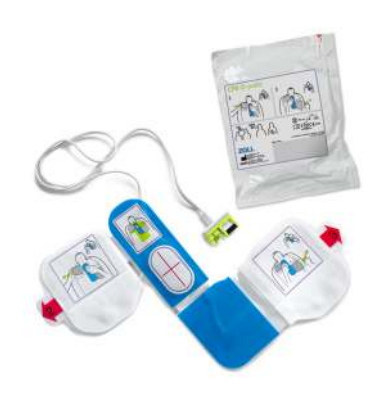
Dropbox link to Image