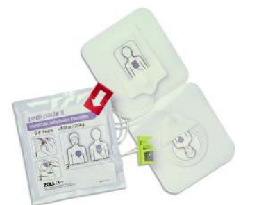
Dropbox link to Image

This revolutionary one-piece adult electrode ensures fast and accurate placement, then senses and reports the depth and rate of the chest compressions to the ZOLL AED Plus®. With a five-year shelf life, the CPR-D-padz electrode has the longest shelf life of any disposable electrode.