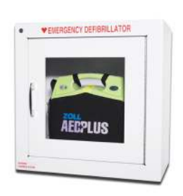
Dropbox link to Image